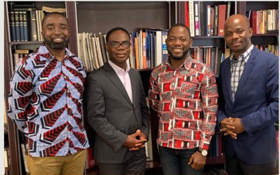
United States of America (USA)

In the USA, initial efforts were started in mobilising financial and human resources for the PENSA Int. vision.