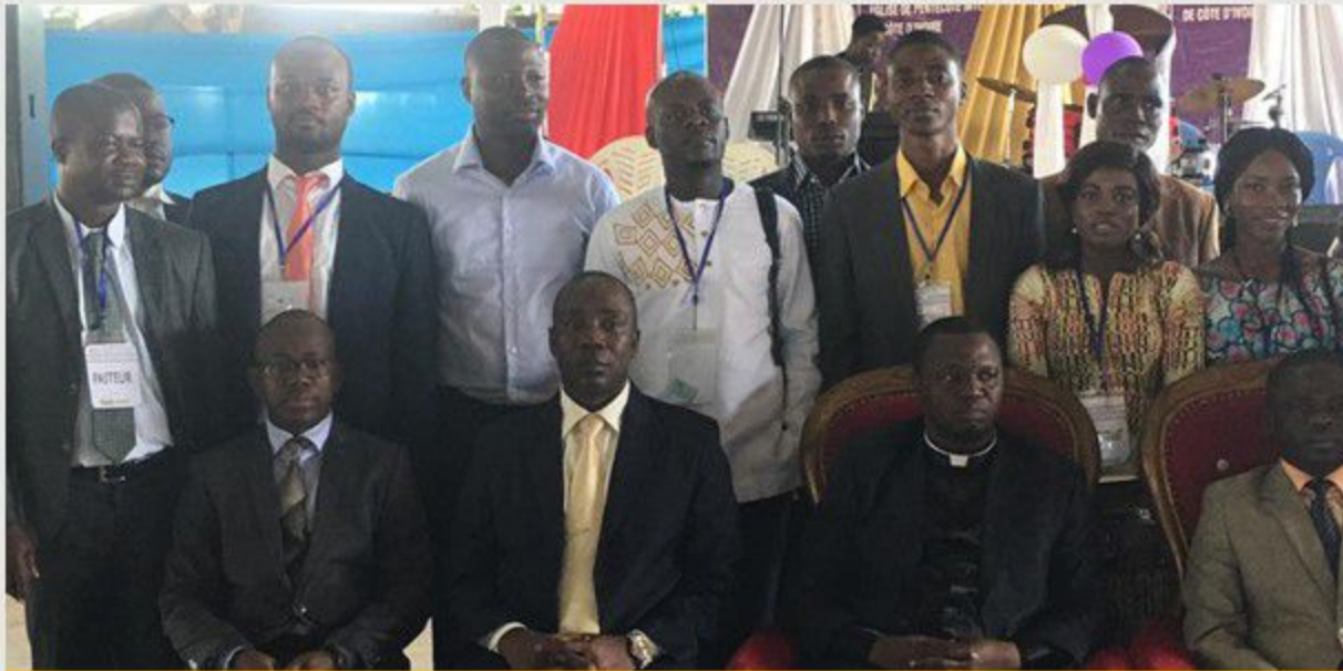
La Cote D'Ivoire

PENSA International participated in the 2019 National PENSA conferences of La Cote D'Ivoire and the United States of America (USA). At both conferences the PENSA Int. vision was cast.