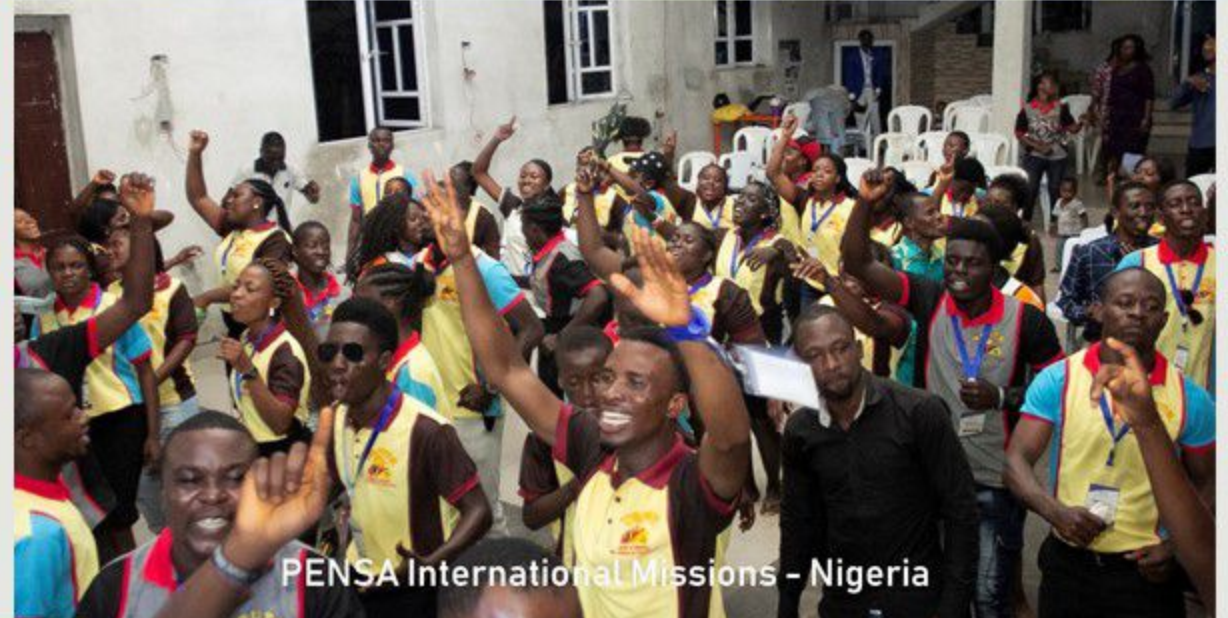
PENSA International Missions - Nigeria